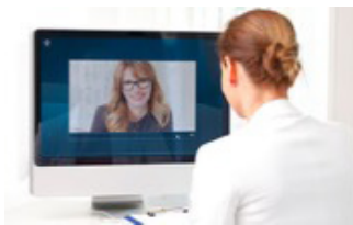
Video 1:1 Interviews